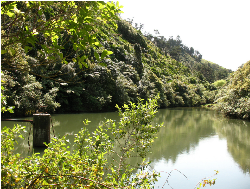
Map Change at the Reservoir