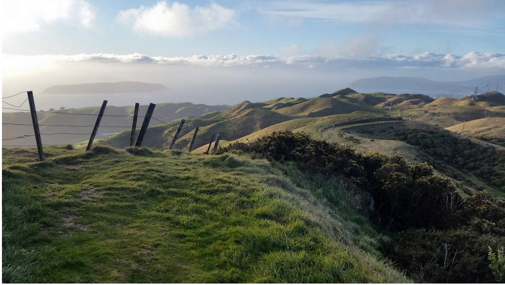
Did you take time to see Mana Island?