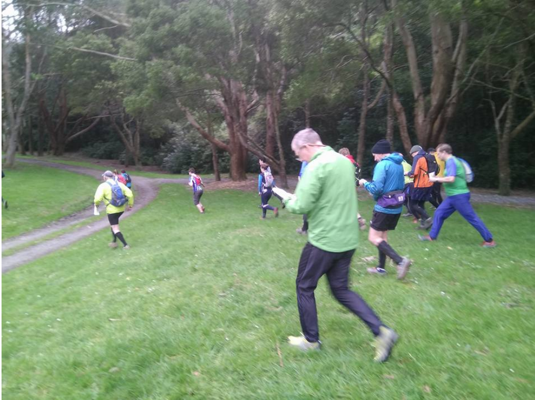
Start of the Winter Classic in Spicer Botanical Park