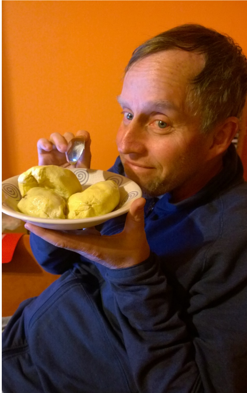
Father's Day present after event– one of my favourite foods – Durian (People try Durian – the smelliest fruit in the world)